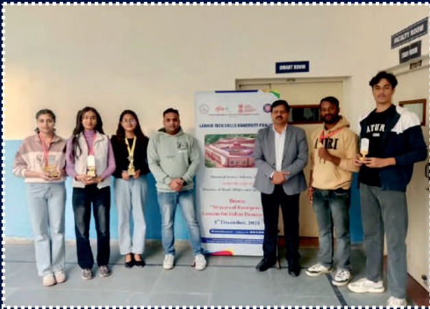
Students have qualified for the State Level Youth Parliament under NSS