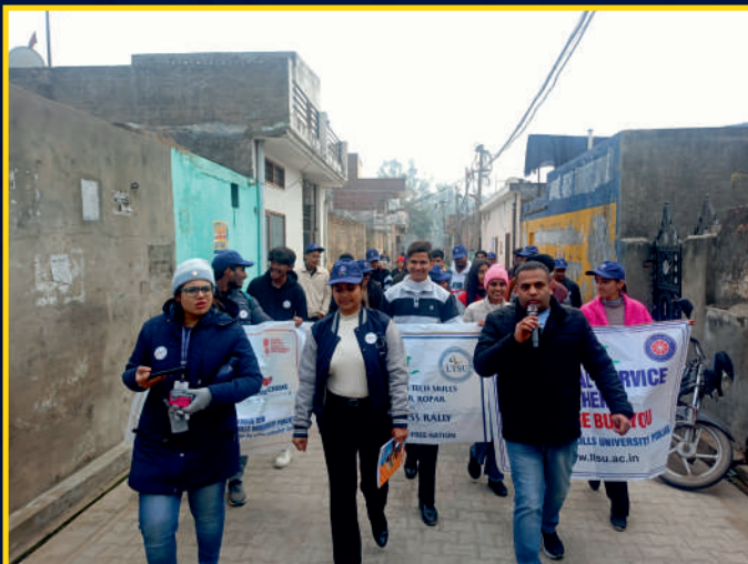
National Youth Day