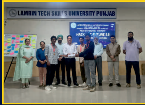
Hack the Future 2.0 Unleash your skills in Cyber Security, CTF, AI/ML & Data Science