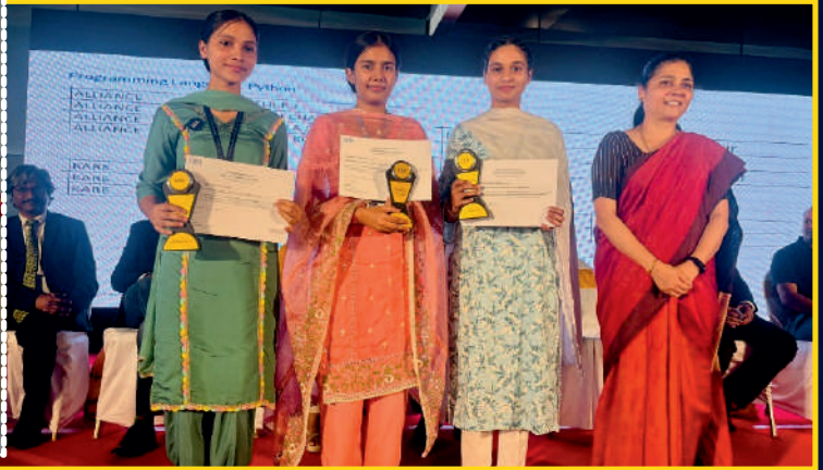
Students Shine @IBMs' National Hackathon!