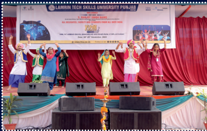
Yuva Kaushal Utsav