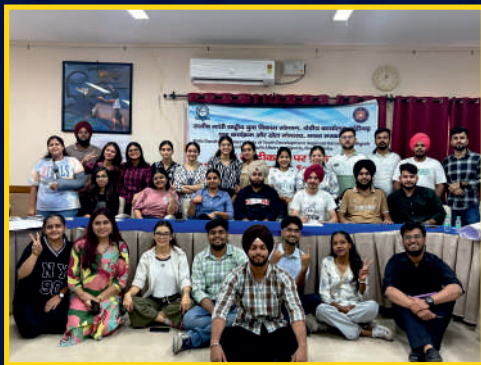
Gender Sensitization Training Programme