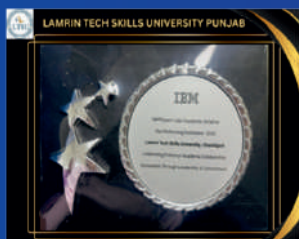
Certificate of Institutional Excellence by IBM