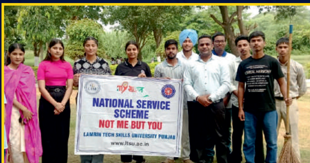
USET Students Lead 'Swachhta Hi Sewa' Campaign