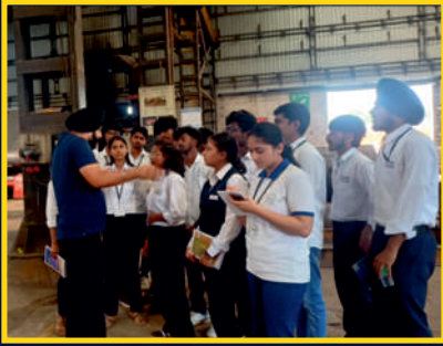
Industry Visit at Cheema Boilers Ltd.