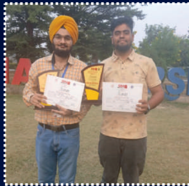
First prize at Tech Pragma