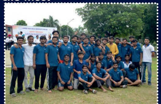
Students Celebrating Janamashtami