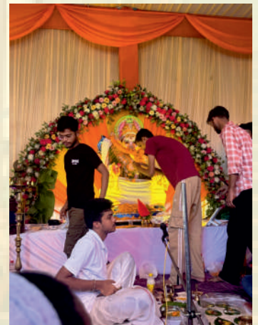
Ganesh Chaturthi Celebration