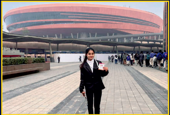
BHARTI Reach National Finals of Viksit Bharat-2026