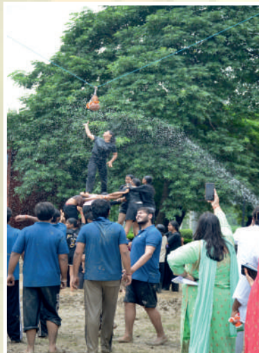
Matki Phod Competition